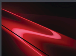
Soul Red Crystal