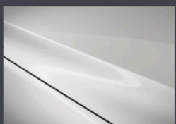
Snowflake White Pearl