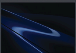
Deep Crystal Blue