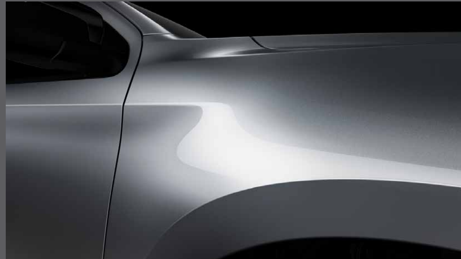
Ingot Silver Metallic