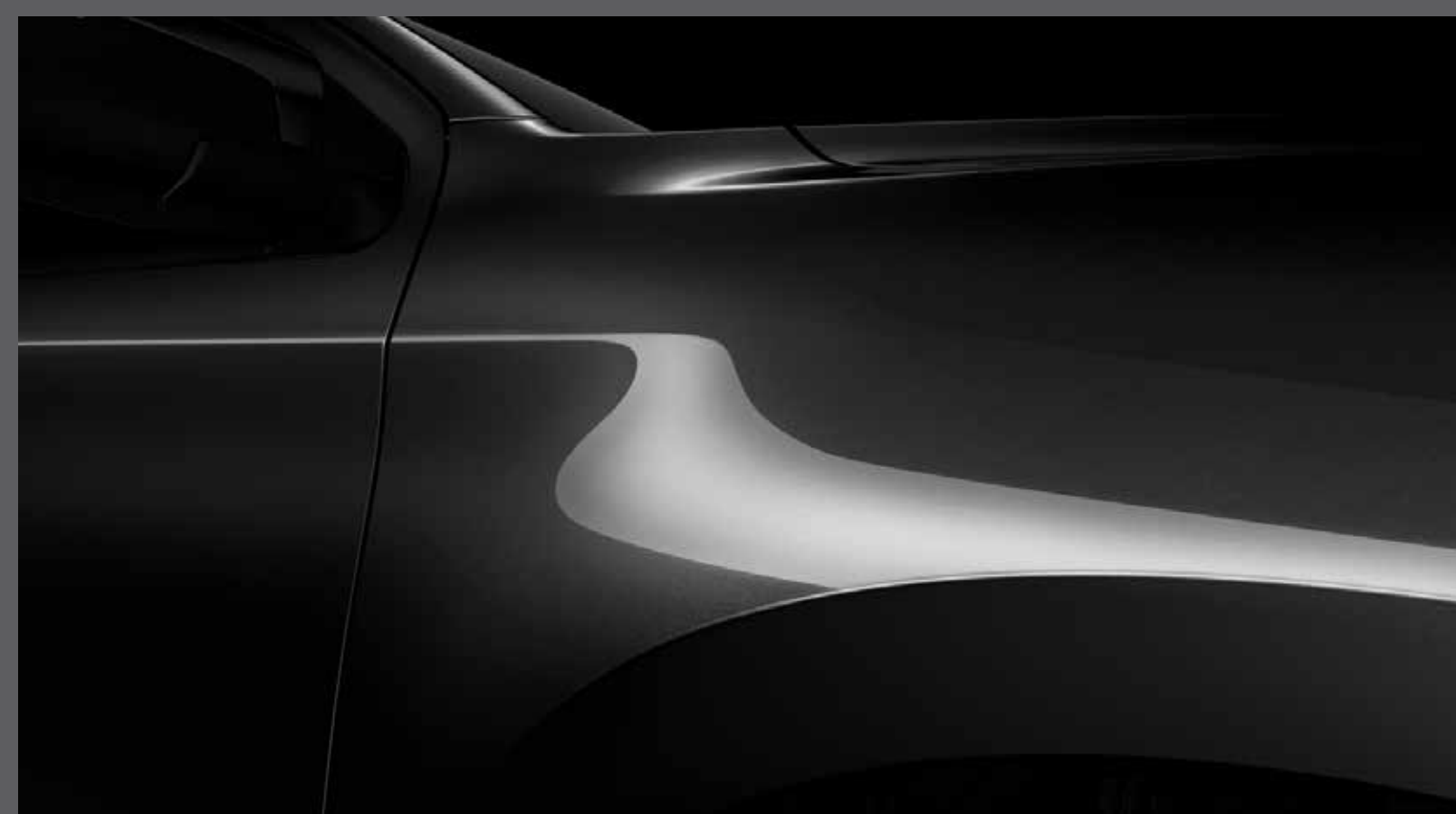
True Black Mica

Mazda Philippines reserves the right to change or modify equipment specifications at any time without prior notice. Details, Colors, Specifications are for information only.