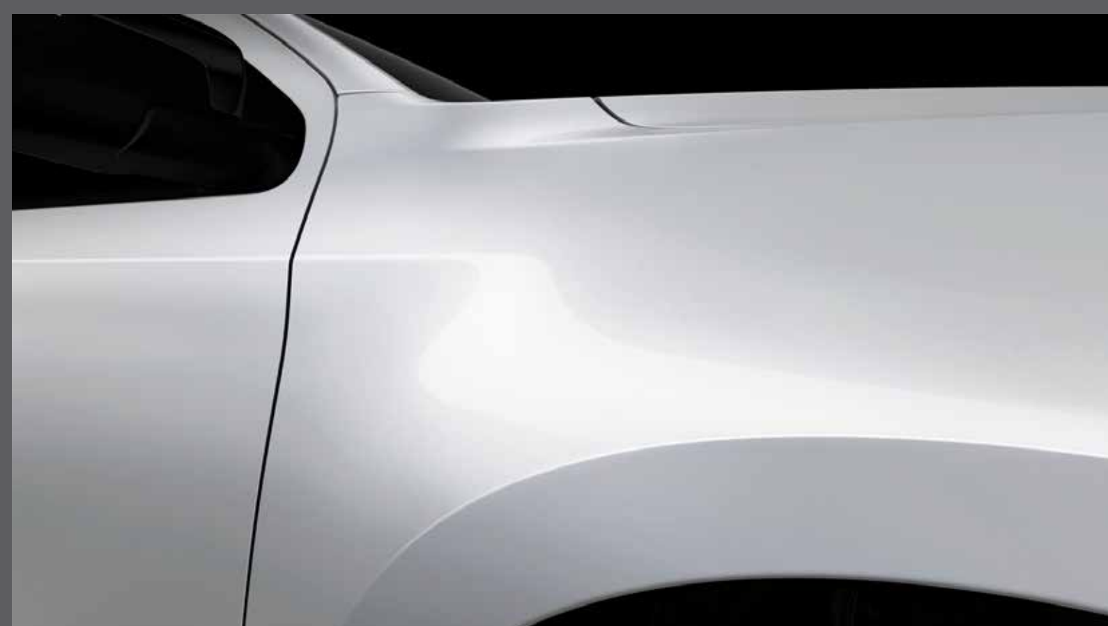
Geode White Pearl