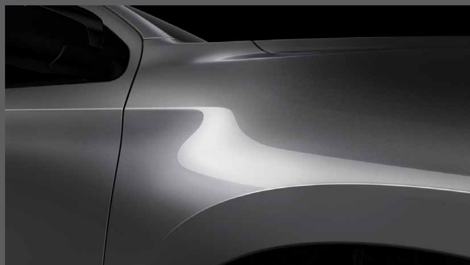
Concrete Gray Mica