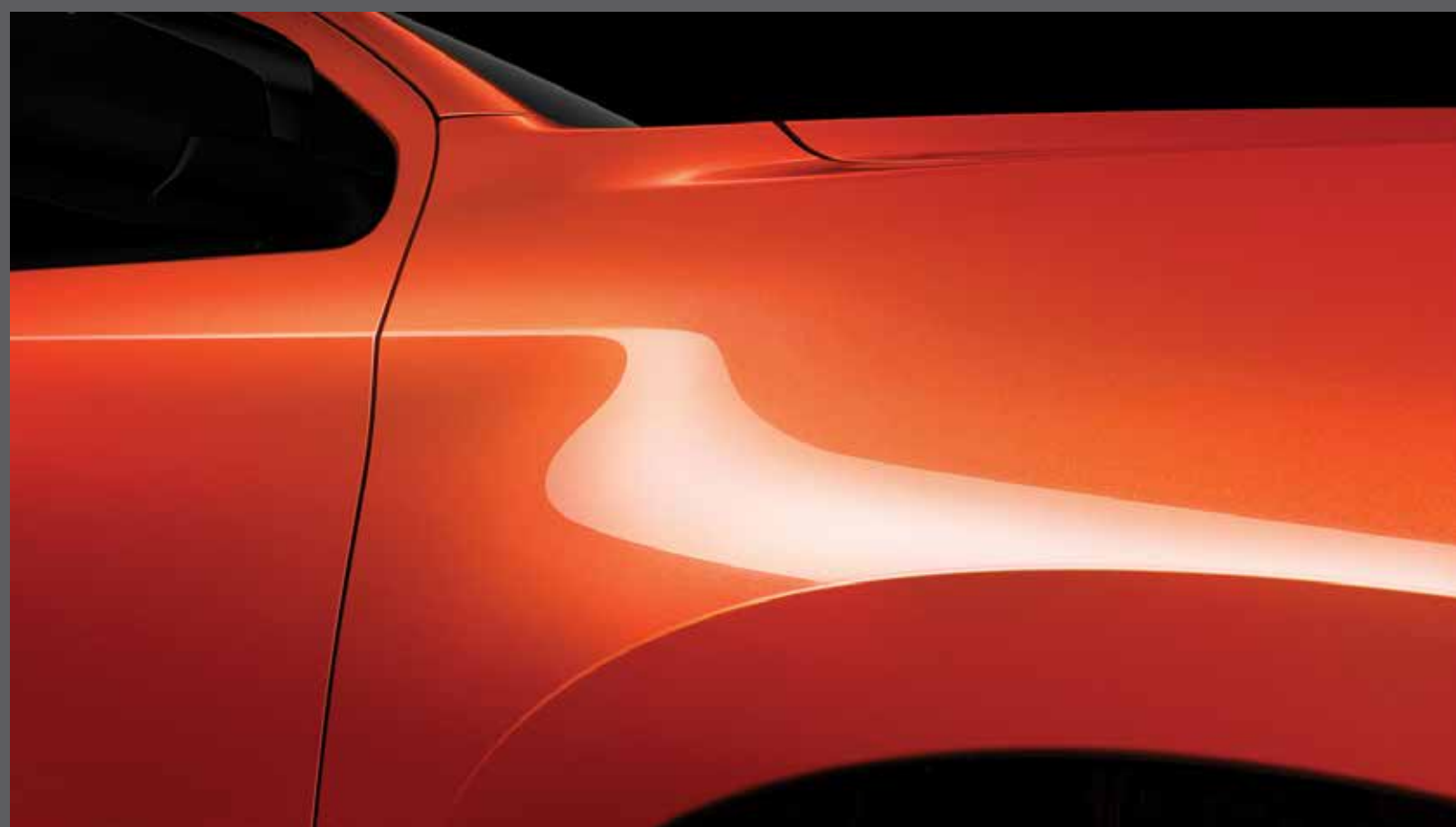
Red Earth Metallic