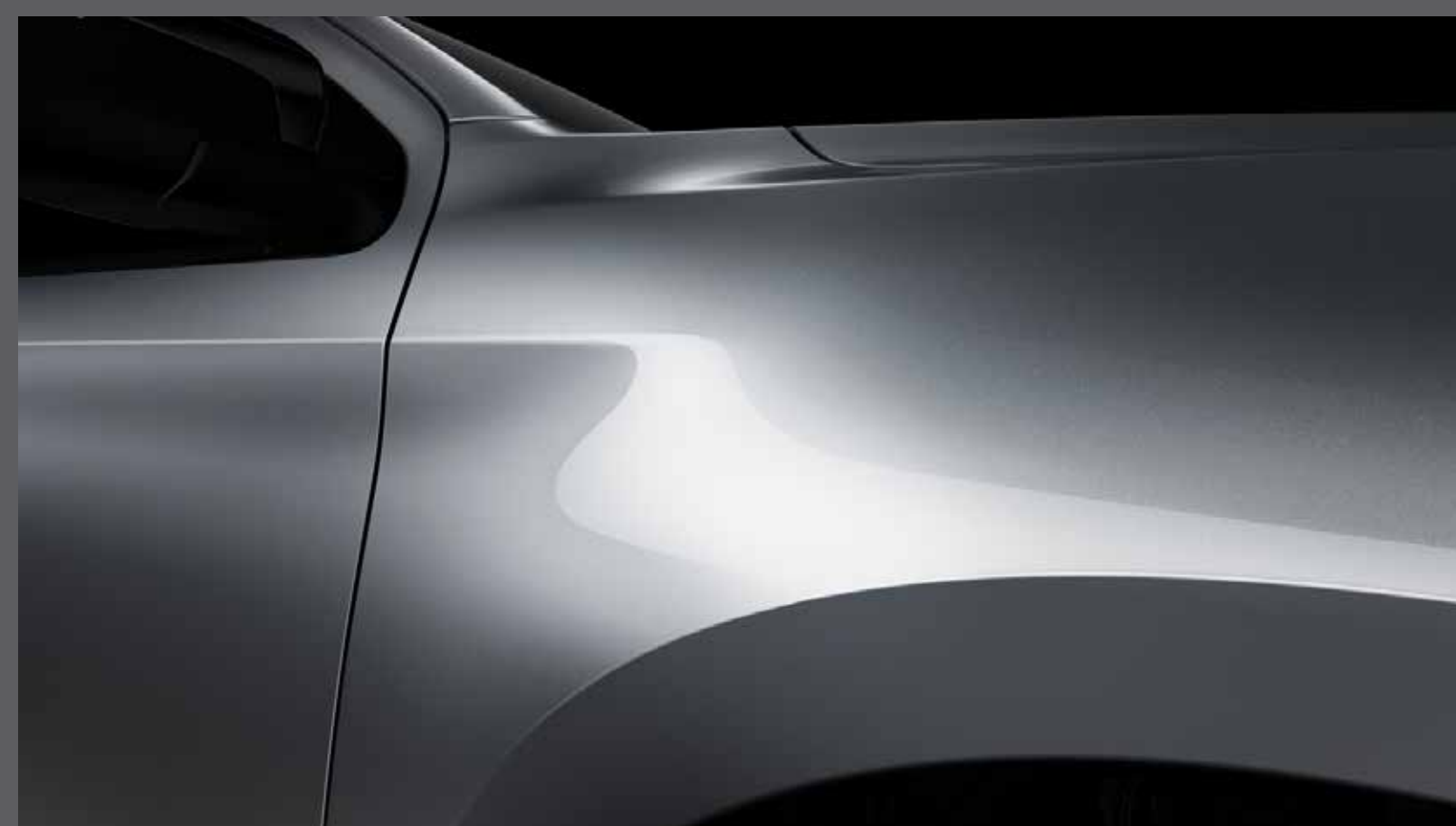
Ingot Silver Metallic