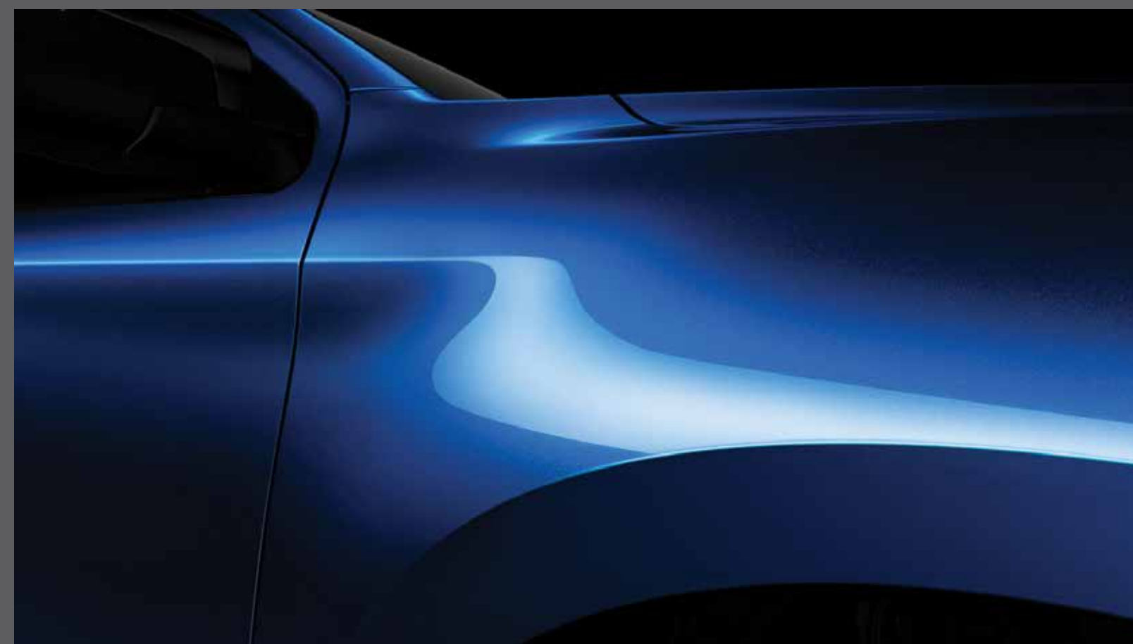
Sailing Blue Metallic