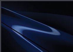
Deep Crystal Blue