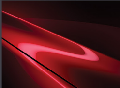
Soul Red Crystal