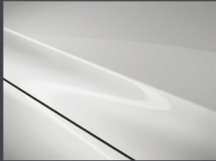
**Snowflake White Pearl