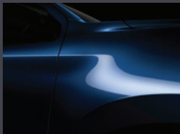
Gun Blue Metallic