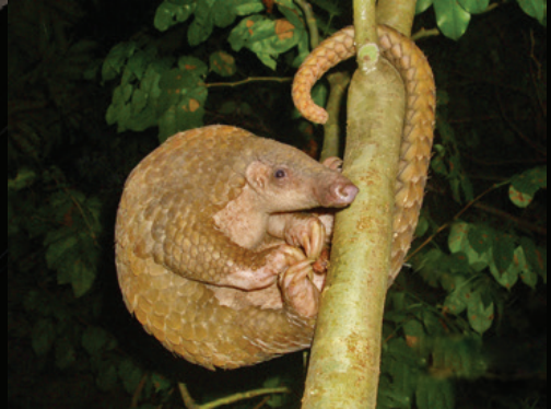
Katala Foundation Inc.

The BT-50 Pangolin is Mazda's tribute to the Philippine Pangolin, which is endemic to our country and is found in the Palawan region. Today, the Mazda BT-50's biggest task is to be the reliable mobility partner of Katala Foundation, a Palawan-based NGO working on the conservation of the Philippine pangolin and other threatened wildlife species.