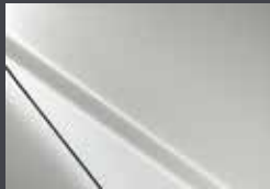
Snowflake White Pearl