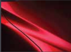
Soul Red Crystal