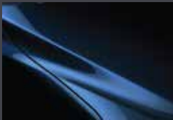
Deep Crystal Blue