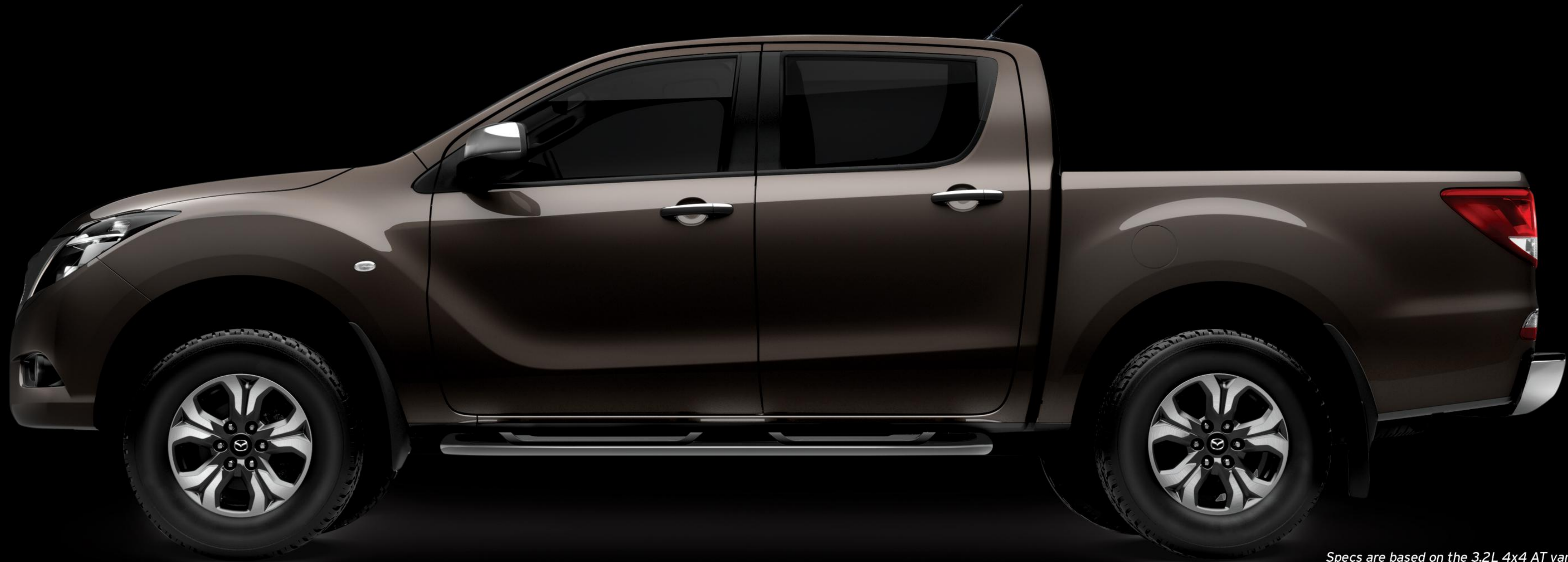
Specs are based on the 3.2L 4x4 AT variant.

Power: 200 PS @ 3,000 RPM • Torque: 470 NM @ 1,750-2,500 RPM